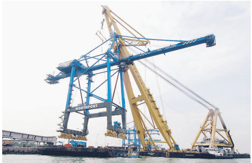
The new super post-panamax ship-to-shore cranes will further boost its capacity from the present four million TEUs (20-ft equivalent units) per year.

Its other future development plan, not included under the RM585mil